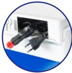
Spacious cable compartment for 12/230V plug