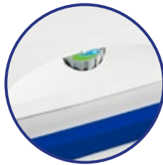
Extra big Manual Min/Max Regulation